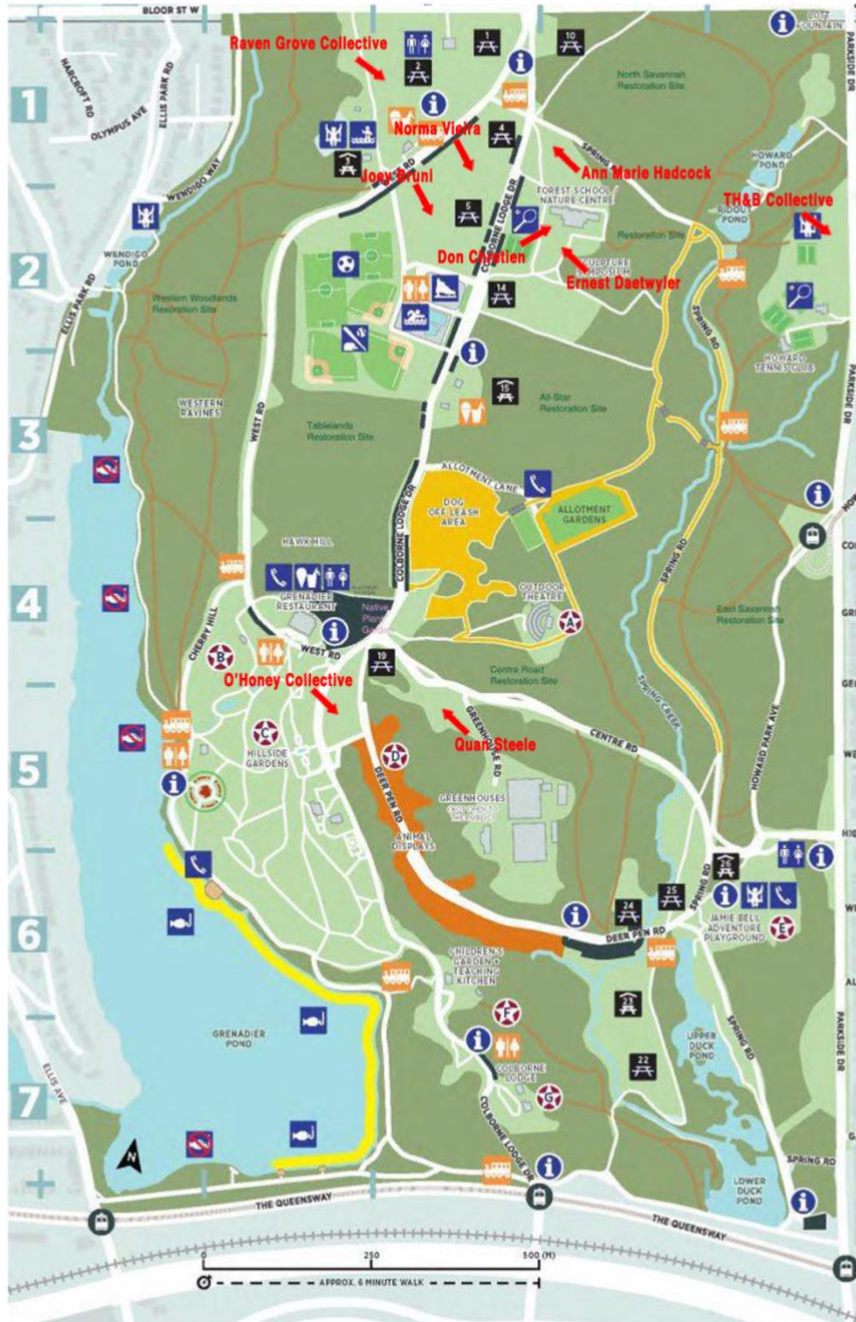
Old Growth Resurrection - Site Map #2 - High Park, Toronto