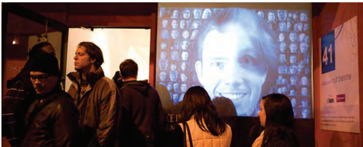
Propeller's exhibition 'Face it Head on: Self-Portrait Redefined' for Nuit Blanche 2010, Outside the gallery, (photo credit: Tony Saad)

By contrasting the non-literal portraits within the gallery space with the digital community portrait, the exhibition will explore the limitless ways in which we construct our own identity while simultaneously redefining approaches to the self-portrait.